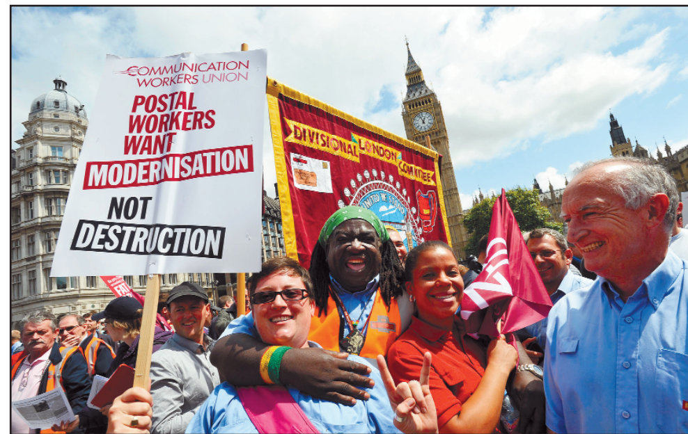
Who will stand up for the postal workers?

Given the current lack of political representation of ordinary working-class people in British politics, the organisations and individuals involved in those discussions regard it as vitally important to organise a general election challenge. As a minimum, we intend to stand against as many current cabinet ministers as possible, together with other ministers and prominent ex-ministers who have been complicit in New Labour's anti-working-class policies.